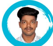
SARAN V IT Mphasis The Next Applied CTC : 4 LPA