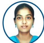
DIKSHA CSE CGI CTC : 3.91 LPA