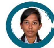
POOJASHRI BIOTECH UO CTC : 7.5 LPA