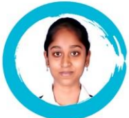
VARSHA V ECE