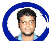
BALU V BIOTECH TATA CTC : 3.5 LPA