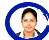
LEKYA B BIOTECH