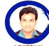
LOKESH K ECE