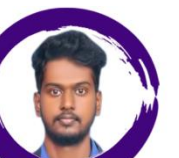
DEVA P R ECE Mphasis The Next Applied CTC : 4 LPA