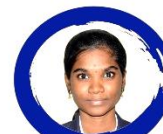
SELVI A ECE Mphasis CTC : 3.25 LPA