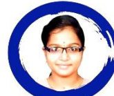
TISHITHA IT CSS CORP CTC : 1.8 LPA