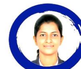
ASLINA SUBINA BIOTECH