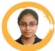
CHANDRA YAMUNA ECE