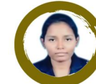
NIBHA B BIOTECH UO CTC : 7.5 LPA