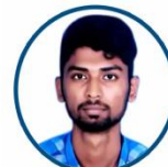
DHANUSH S CHEMICAL CTC : 1.44 LPA