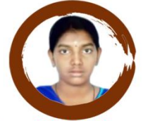
SHILPA S BIOTECH