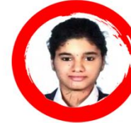
MEGHNA N V P BIOTECH