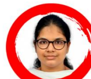
SARUPYA G IT