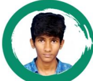
ABU SAYID CSE