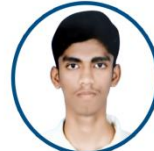
MERIL AKASH IT Capgemini CTC : 4.25 LPA