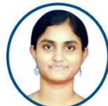
THAPASYA K ECE CGI CTC : 3.91 LPA