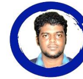
BALU V BIOTECH

TATA TATA CONSULTANCY SERVICES CTC : 3.5 LPA