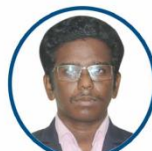
JAISURIYA Y CSE virtusa CTC : 5.5 LPA