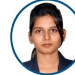
PONVATHANI P BIOTECH Mu Sigma CTC : 5 LPA