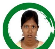
POOVIZHI K CSE