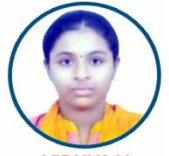
VIDHYA V ECE