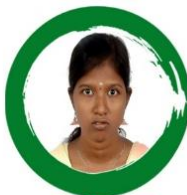
POOVIZHI K CSE