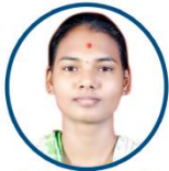
PAVITHRA V BIOTECH