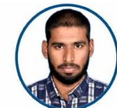
JASIR M BIOTECH CTC : 4 LPA