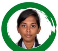
POOJASHRI BIOTECH wipro CTC : 3.5 LPA