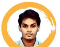
VISHWA R L MECH