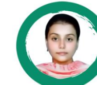
JOTHIKA CSE UO CTC : 7.5 LPA