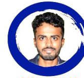
AKHASH K CSE

TATA TATA CONSULTANCY SERVICES CTC : 3.5 LPA