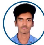
GOWTHAM S S BIOTECH