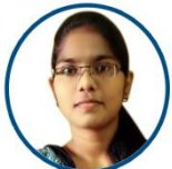
ABISHEGA B CSE CONCENTRIX CTC : 3 LPA