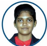
YAMUNA CSE TATA CTC : 3.5 LPA