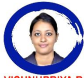
VISHNUPRIYA B BIOTECH