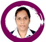
ABARNA C ECE