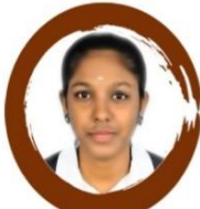
DIVYA E BIOTECH VISIONARY RCM CTC : 1.92 LPA