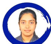
VARSHA SUNIL BIOTECH