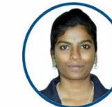
SRIMATHI S CSE CTC : 4 LPA