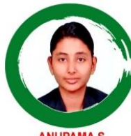
ANUPAMA S ECE