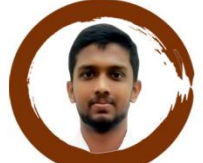
GOWSHIN SJ CSE FLATIRON CTC : 4 LPA