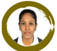
DIVYA E BIOTECH