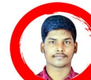
PAIYAVULA DAMU CSE Mphasis The Next Applied CTC : 4 LPA