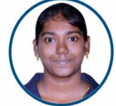
WINSELIN A CSE ZOH CTC : 7 LPA