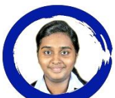
SHERLENE T BIOTECH