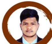
IDAYATH B MBA