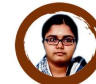
VINDA V BIOTECH UO CTC : 7.5 LPA