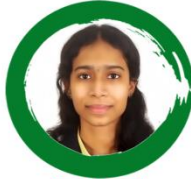
SRIJA M BIOTECH