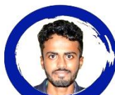
AKHASH K CSE TATA CTC : 3.5 LPA