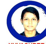
YUVASHREE E CSE