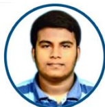
SAISIVA K N MECH CTC : 4 LPA