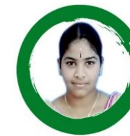
MYTHILI C CSE