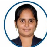
YERRAMACHETTY PUJA ECE TATA CTC : 3.5 LPA