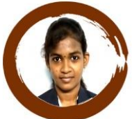
SRRI VIDYAA K ECE