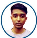
JISHNU S ECE