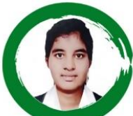
GENCY T ECE KIML Kangra Industrial Park Pvt. Ltd. CTC : 1.8 LPA