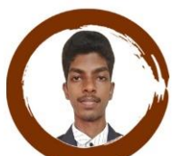
VINITH T ECE