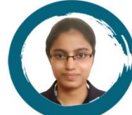
CHANDRA YAMUNA ECE UO CTC : 7.5 LPA