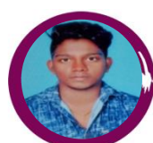
LIVINGSTON T.A CSE TATA ELXSI CTC : 5.5 LPA