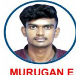
MURUGAN E CHEMICAL CTC : 1.44 LPA