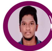
PRANIT R ECE Skill VERTEX CTC : 6 LPA